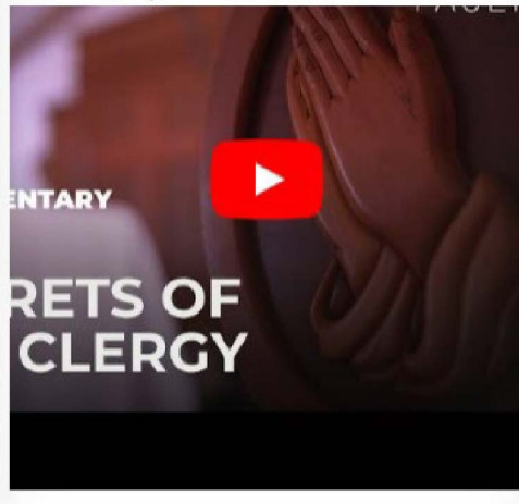
Al-Jazeera examines the role of clergy confidentiality, and how it has devastated the lives of victims of child abuse in the Jehovah's Witness and Mormon Churches.