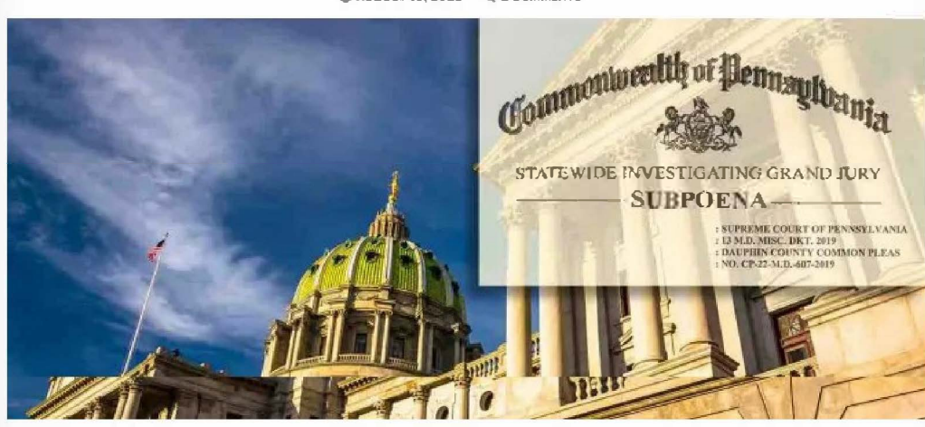
Published February 8th, 2020

n 1884, the Watch Tower Bible and Tract Society was incorporated in the Court of Common Pleas in the Commonwealth of Pennsylvania. The movement of Charles Taze Russell became an established religious business, a tax-exempt corporation that would go on to control the lives of more than 8 million devoted followers,