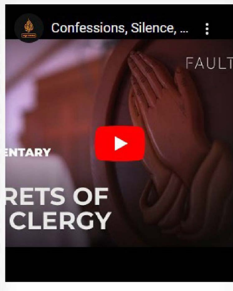
Al-Jazeera examines the role of clergy confidentiality, and how it has devastated the