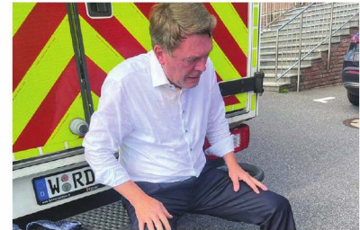
One of Jehovah's Witnesses pictured immediately after he was attacked by an assailant who used pepper spray