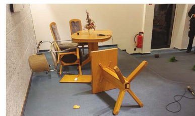
The interior of a Kingdom Hall in Bassum after it had been vandalized

In a number of cases where Witnesses have suffered violence, the police, prosecutors or courts have failed to acknowledge that the crimes were motivated by hate and/or religious intolerance