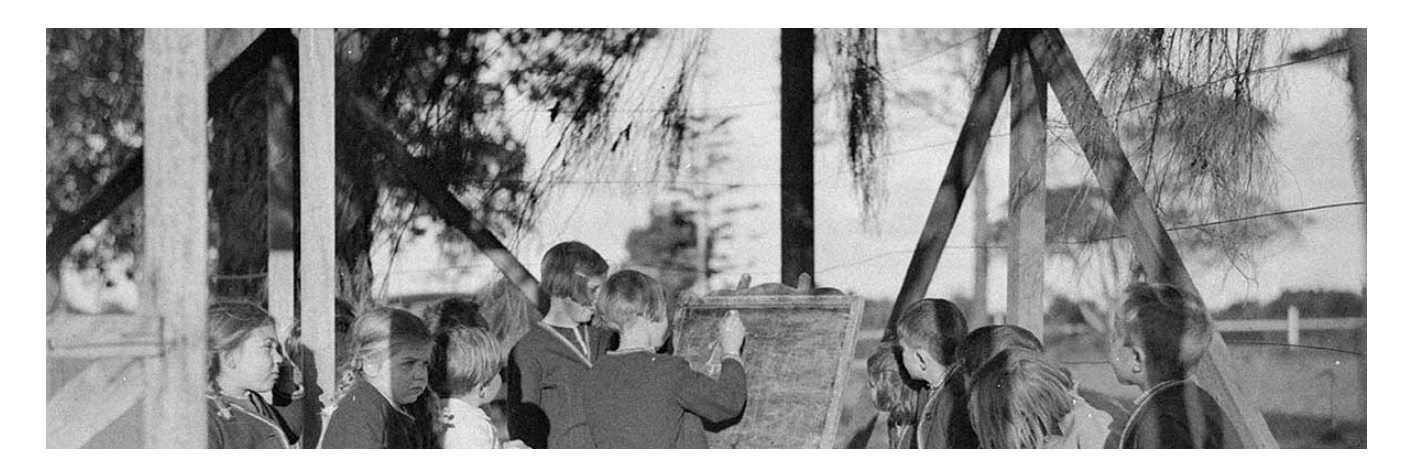
Dalwood Children's Home, Seaforth, on Sydney's North Shore, 1929

Child migrants were usually eight to 13 years of age on their arrival in Australia, although many were younger than this, some as young as three. Child migrants were sent to charitable or welfare institutions across the country, often run by Christian religious orders.