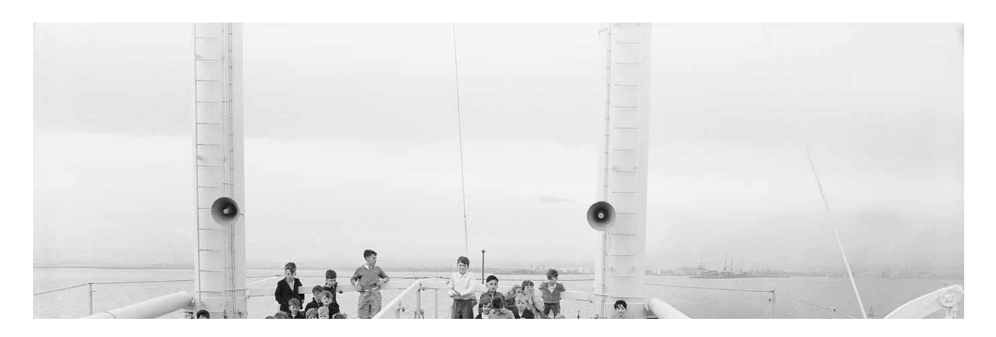
A group of children aboard the Sitmar liner Fairsea

SEE OUR CLASSROOM RESOURCE (HTTPS://DIGITAL-CLASSROOM.NMA.GOV.AU/DEFINING-MOMENTS/NATIONAL-APOLOGY-FORGOTTEN-AUSTRALIANS-AND-FORMER-CHILD-MIGRANTS)