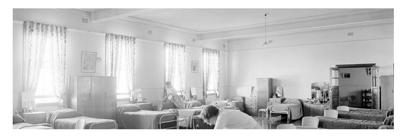
Home of the Good Shepherd, Ashfield, Sydney, 1963