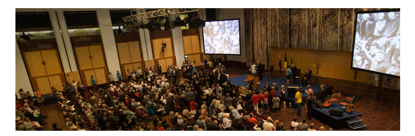
National Apology to the Forgotten Australians and Former Child Migrants, Great Hall at Australian Parliament House

shores as children without your consent, that we are sorry. Sorry – that as children you were taken from your families and placed in institutions where so often you were abused. Sorry – for the physical suffering, the emotional starvation and the cold absence of love, of tenderness, of care. Sorry – for the tragedy, the absolute tragedy, of childhoods lost – childhoods spent instead in austere and authoritarian places ... Sorry – for all these injustices to you ... who were placed in our care ... And let us also resolve this day that this national apology becomes a turning point in our nation's story. A turning point for shattered lives. A turning point for governments at all levels and of every political hue and colour to do all in our power to never let this happen again. For the protection of children is the sacred duty of us all.