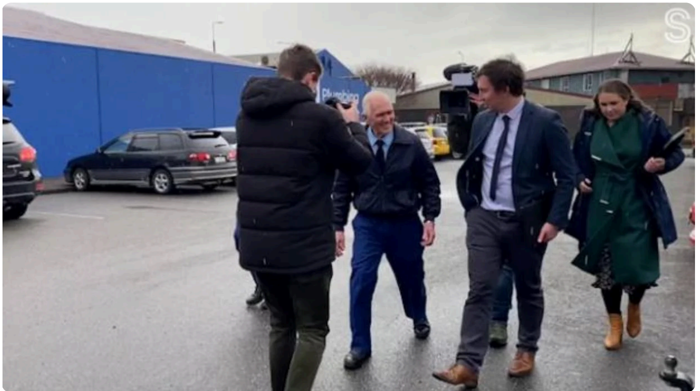
Gloriavale overseeing shepherd appears in court for alleged sexual offending

Gloriavale's overseeing shepherd is facing 27 charges of sexual offending spanning more than 23 years against 10 alleged victims.