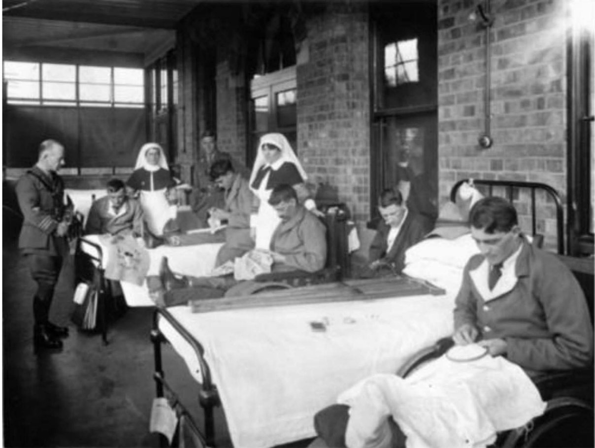
World War I returned servicemen embroidering [Christchurch Public Hospital].

War injuries also helped in the development of improved medical skills such as treatment for burns, plastic surgery and orthopaedics.