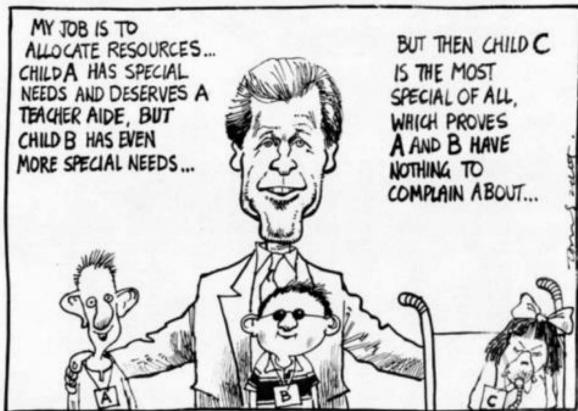
1995 Tom Scott Cartoon featuring Minister of Education Lockwood Smith and three children with special needs.

A Learning Support Action Plan developed by the Ministry of Education in 2019 sets out a plan to increase access to education and support for disabled children over time.