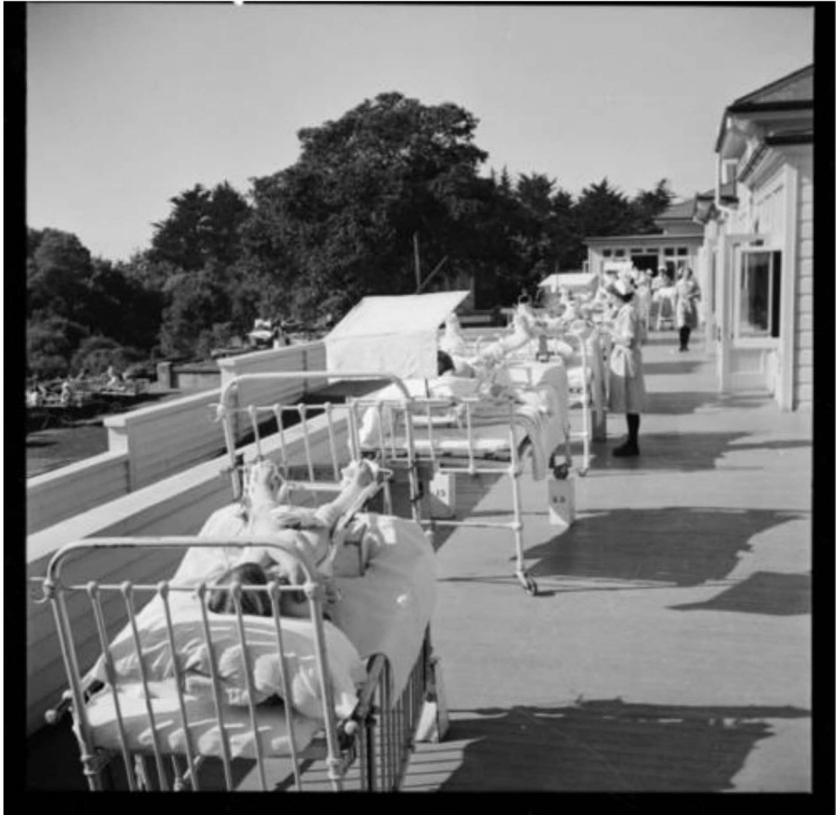
The Wilson Home for crippled children in Takapuna, Auckland.