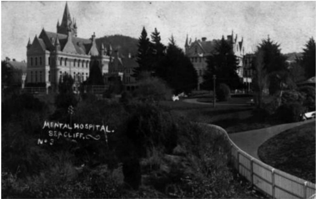
Seacliff Hospital, Dunedin, showing the grounds, taken 1912 by an unidentified photographer.

French-born nun, Suzanne Aubert, had personal experience of disability and was one of the few to speak out against eugenics. She founded her Home for Incurables in Whanganui in 1899 and, in 1907, opened her first Home of Compassion for all 'needy' or disabled adults or children in Wellington.